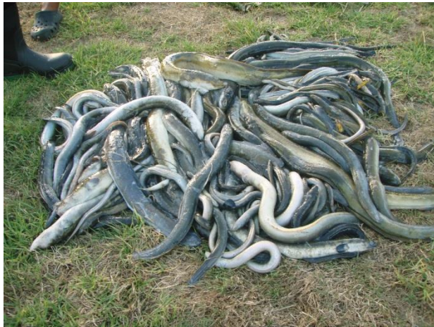
Alkaline wastewater can kill wildlife

Lime is a major component of cement and is found in concrete products. When dissolved in water, cement produces an alkaline solution with elevated pH that can burn and kill fish, insects and plants. Water that comes into contact with unset concrete or concrete dust quickly increases in alkalinity and can cause significant harm to aquatic life.