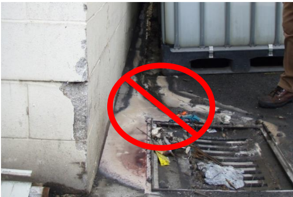
Keep chemicals away from stormwater drains