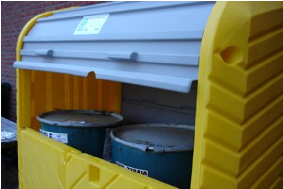
Secondary containment with cover